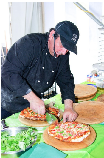
Paris from Amore Woodfired Pizza cooking up healthy pizzas at a recent community fair

For more information on the event, check out the website: http://www.cadell.org.au/html/pumpkin-competition.html