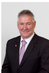
Mayor Dave Burgess