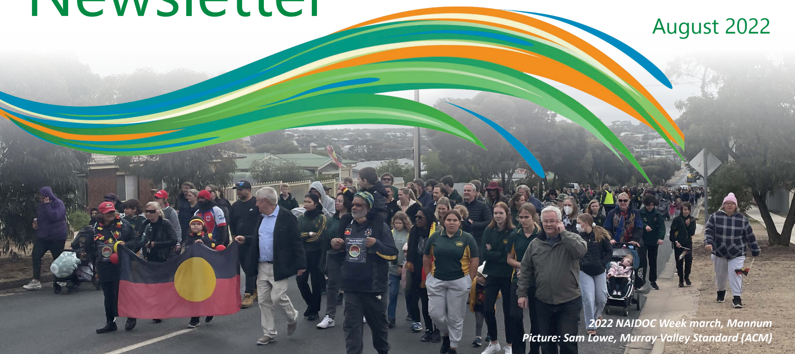
2022 NAIDOC Week march, Mannum