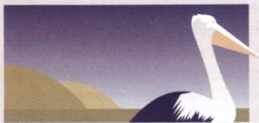
MID MURRAY COUNCIL

Work has progressed well on the construction of a new building comprising Council office and Library at Morgan. The building will be completed and in use later this year. New public toilets have been built adjacent to this complex.