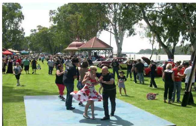
Mannum Hot Rod Show