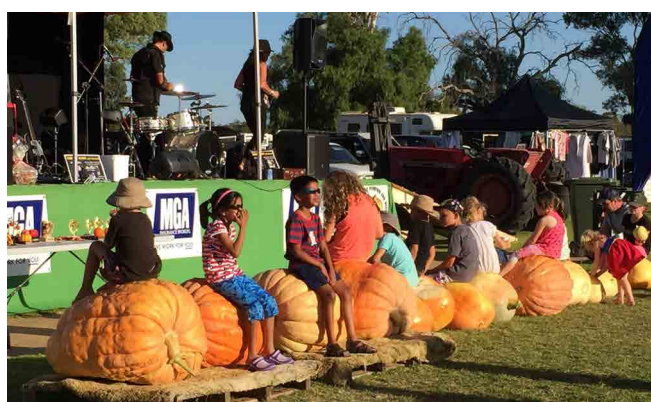
Cadell Harvest Festival / Giant Pumpkin Comp