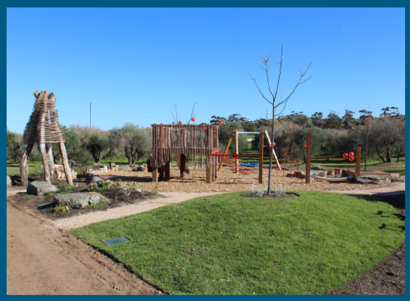
Palmer Nature Playground