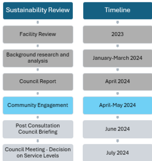
Figure 1 – Facility Review Timeline

There are many variations, to the options stated in this discussion paper, that will be considered and explored through the consultation process.