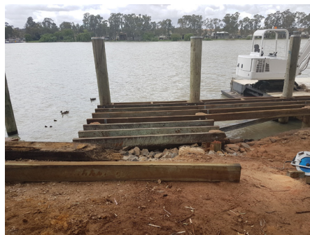
Darling Wharf Upgrade Project - Commenced