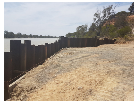
Herrmanns Landing Upgrade Project - Commenced