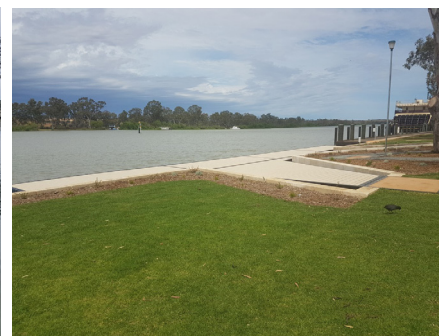
Mary Anne Reserve Wharf Upgrade / Pontoon - Completed