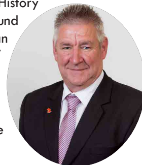
Mayor Dave Burgess