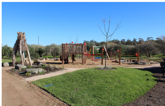
Palmer Nature Play area