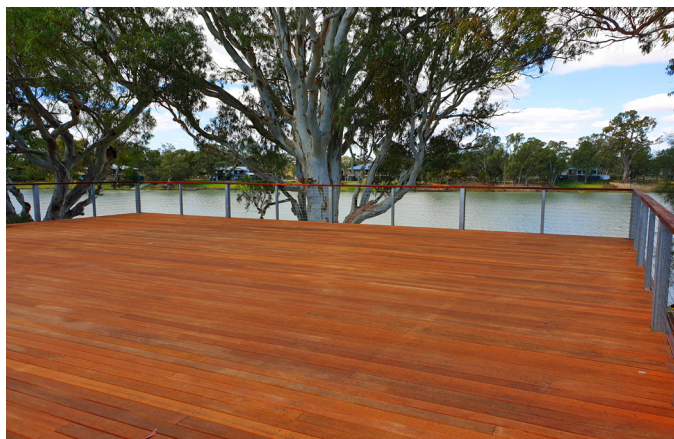
Morgan Pendle's Tea Room deck replacement