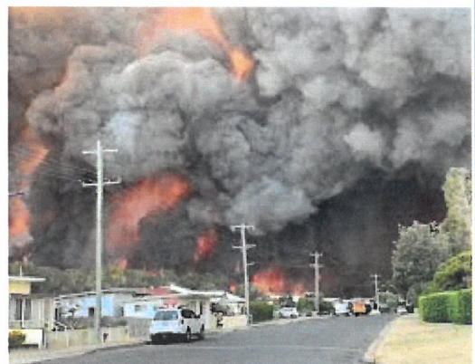
A bushfire and fearsome cloud loom over Harrington, a township in the Mid North of NSW

Should you have any questions or require further information on preparing your properties for the fire danger season, please feel free to contact Council's Fire Prevention Officer at the Cambrai office on 8564 6020 or the CFS.